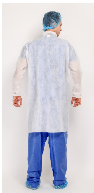
Lab Coat only